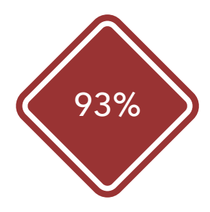
Presenter was well prepared.

Below shows the percentage of workshop attendees that rate us as Excellent in the following categories: