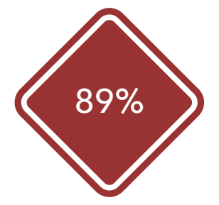
Presenter's ability to respond appropriately to questions.